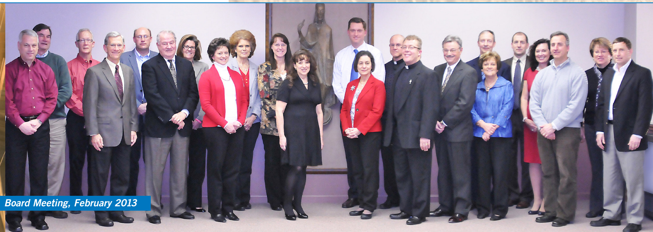
Board Meeting, February 2013

The Catholic Foundation of Southwestern Indiana promotes perpetual funding of Catholic organizations within the Diocese by establishing endowments, managing foundation assets, and providing information on planned giving.