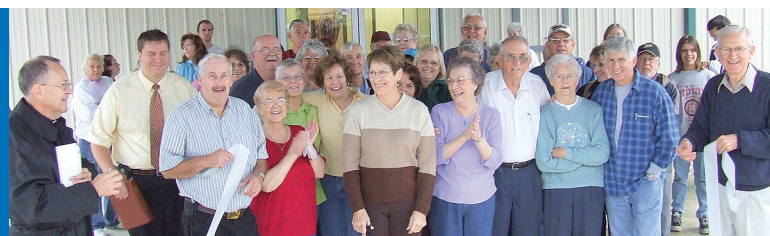
St. Vincent de Paul Thrift Store Grand Opening

It is the mission of the Catholic Foundation of Southwestern Indiana to assist individuals and parishes with planned giving within the Diocese of Evansville. Each of these continues to make a strong statement about their faith as the gifts they make will benefit others forever. They are truly continuing their legacy of faith through permanent gifts. The role of the Catholic Foundation is to ensure that we are managing, protecting and honoring the wishes of these donors.